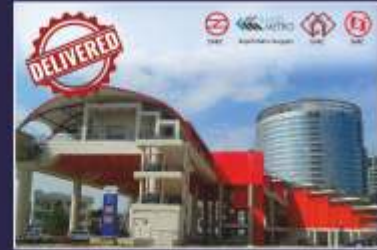
LMRC, DMRC, JMRC and Rapid Metro